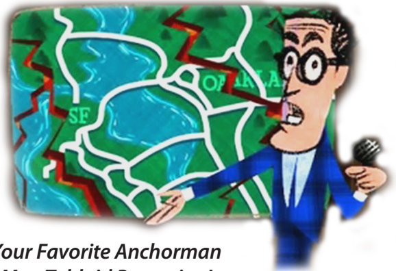
Your Favorite Anchorman Max Tabloid Reporting!